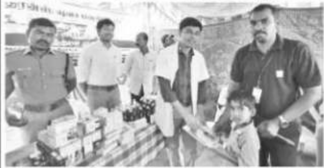
முகாமில் பழங்குடியின பள்ளி மாணவருக்கு விளையாட்டு உபகரணங்கள் வழங்கும் மருத்துவார்.

வால்பாறை, டிச. 31: கோவை தன்னார்வ தொண்டு நிறுவனமான சந்திரன்ஸ் யுவா ஃபவுண்டேஷன் சார்பில் பழங்குடியின மக்களுக்கான இலவச மருத்துவப் பரிசோதனை முகாம் மற்றும் புத்தாடைகள் வழங்கும் திகழ்ச்சி நடைபெற்றது.