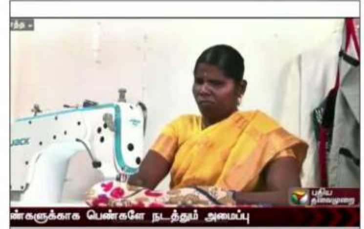
பெண்களுக்காக பெண்களே நடத்தும் அமைப்பு