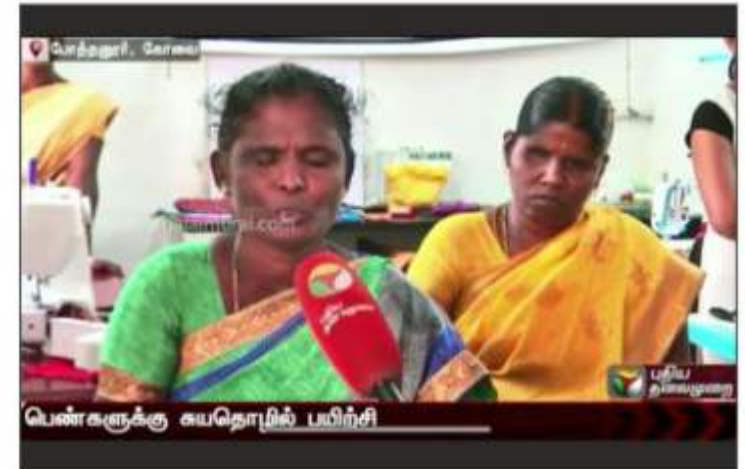
பெண்களுக்கு கயதொழில் பயிற்சி