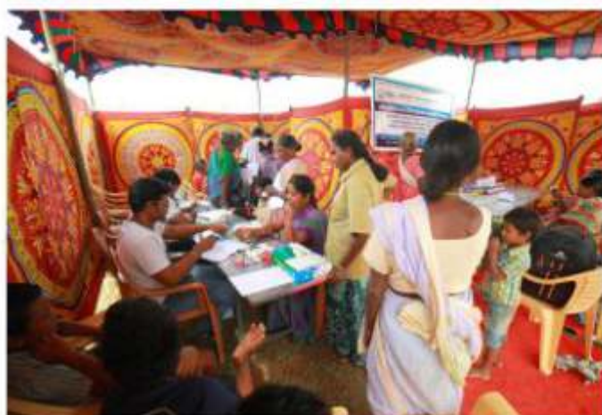
Medical awareness camps, reaching out to the remote and the needful areas around Coimbatore